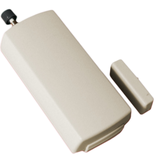
Part No. PAL-102130